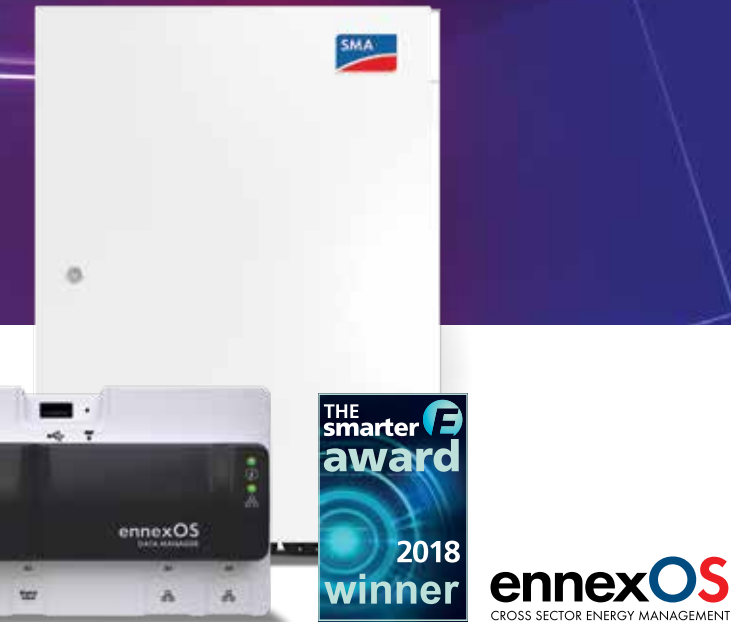
PEAK3 solution with inverter, DC combiner boxes and Data Manager.

The PEAK3 system solution is ready for ennexOS, SMA's ground breaking digital platform. ennexOS converges the data of all relevant energy sectors to achieve modern, forward-looking energy solutions. The platform is regularly updated and currently offers powerful features such as satellite-based performance ratio monitoring. Further information: www.ennexos.com